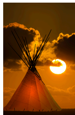
FRIENDS - TIER 5 2,500.00