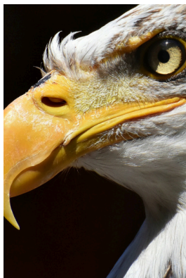
EAGLE - TIER 1 $50,000.00

Hockey Indigenous has over 85,000 followers across all social media platforms and websites. Livestream will be available for your convenience.