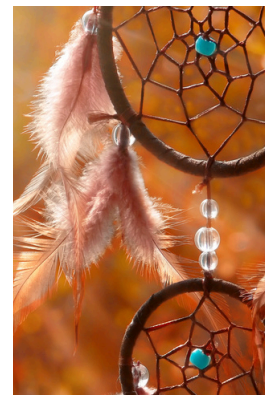
DREAMCATCHER - TIER 3 $10,000.00