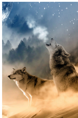
WOLF - TIER 2 $25,000.00