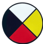
MEDICINE WHEEL - TIER 4 5,000.00